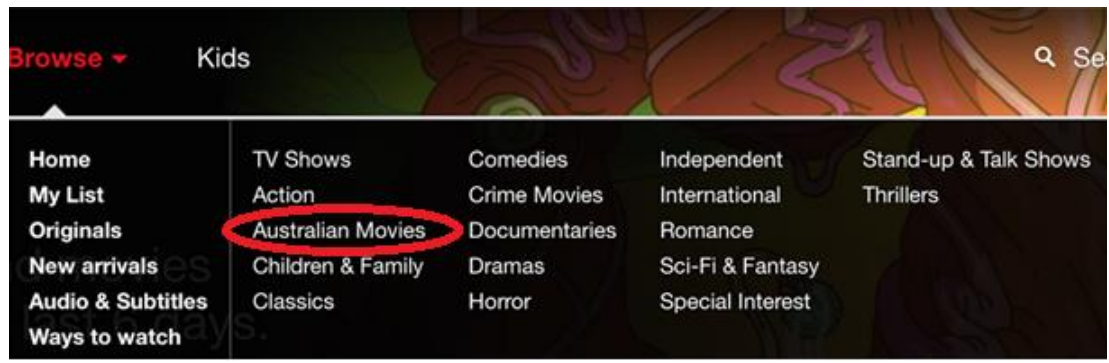
Netflix AU homepage, 06/08/17

Users can access local content in the Australian Netflix catalog by browsing through content categories. Clicking/tapping on Browse provides direct access to the category Australian Movies (with sub-categories Australian Documentaries and Australian Dramas ). Within the TV Shows category there is also a sub-category for Australian TV Shows .