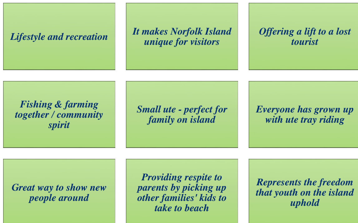
Figure 1.1 ‘Post-its’