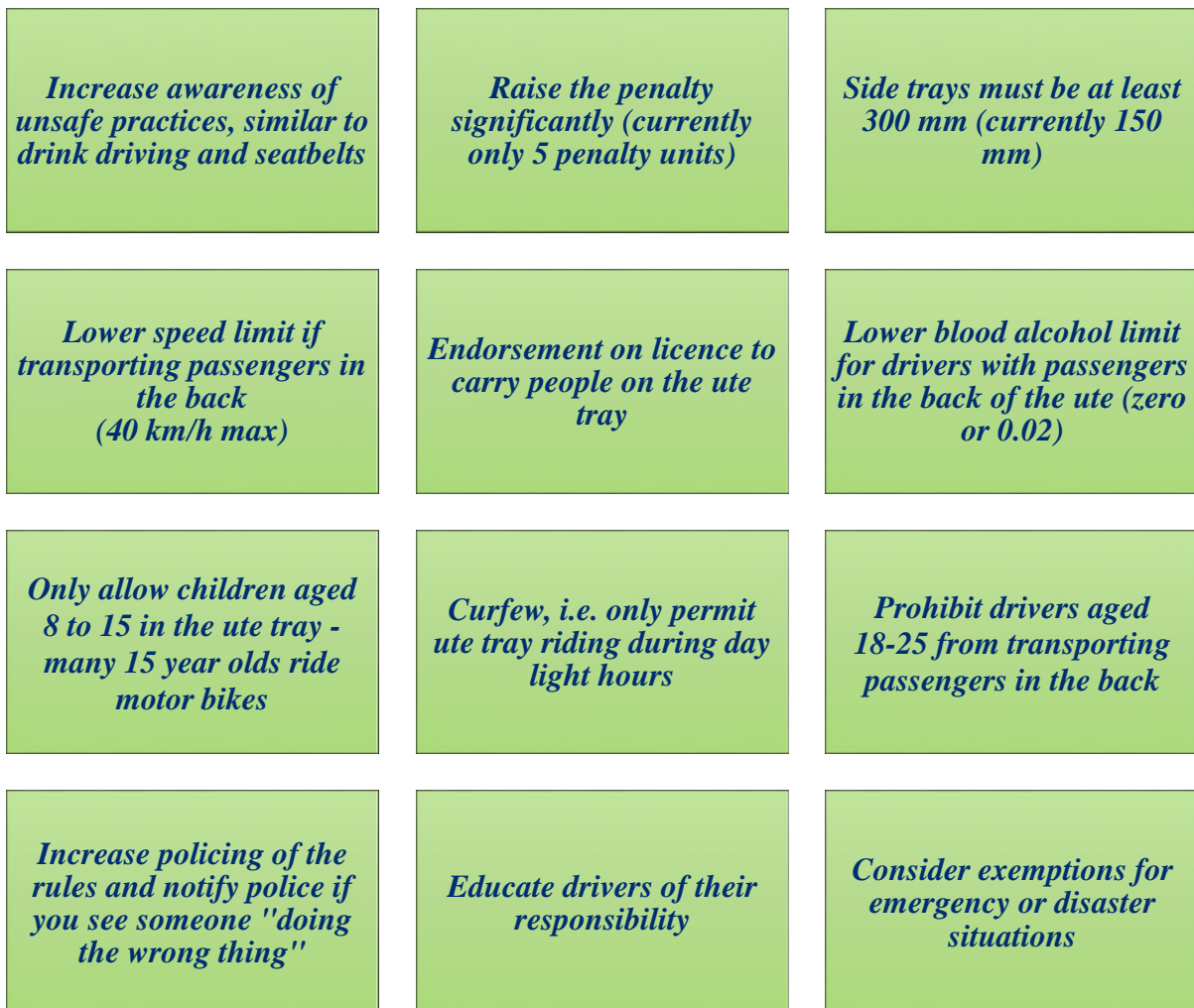
Figure 1.4 ‘Post-its’