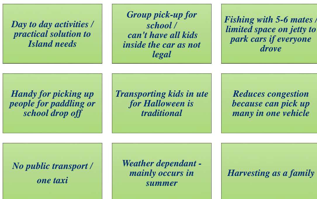
Figure 1.2 'Post-its'