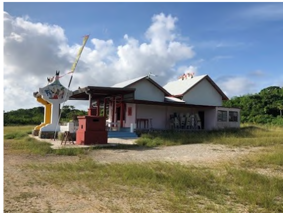
South Point Temple (part of South Point Settlement Remains)

The Phosphate Hill area is the location of the first commercial mining of phosphate on the island. The exposed limestone pinnacles, industrial remains and burial ground reflect the hard work of historic manual mining. Bungalow 702 is a symbol of the Japanese occupation during World War II, and is symbolic to the community. The incline railway, 1930s chute and gear sheds on the Drumsite Industrial Area reflect earlier industrial practices and engineering successes. The incline railway symbolises the successful expansion of the phosphate industry on the island which led to the development of the community. The remains of the South Point Settlement serves as a reminder of one of the early major residential areas on Christmas Island.