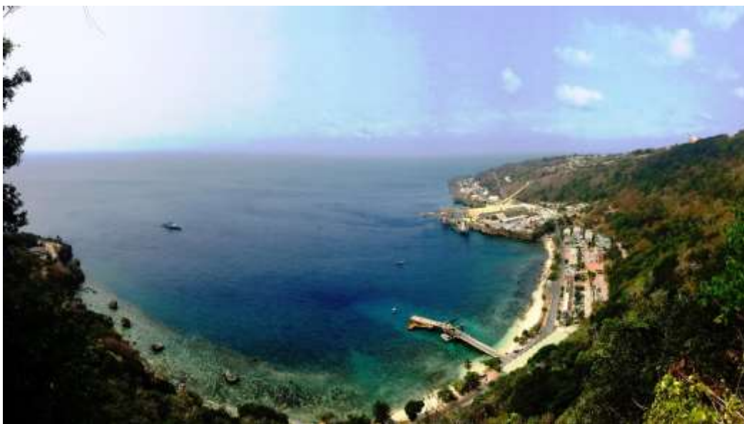
Flying Fish Cove, Christmas Island

The Department may assist prospective proponents by arranging site visits, where access to a site is limited or restricted. Please contact the Director, Indian Ocean Territories Policy, at: indianoceanterritories@infrastructure.gov.au to arrange a site visit.