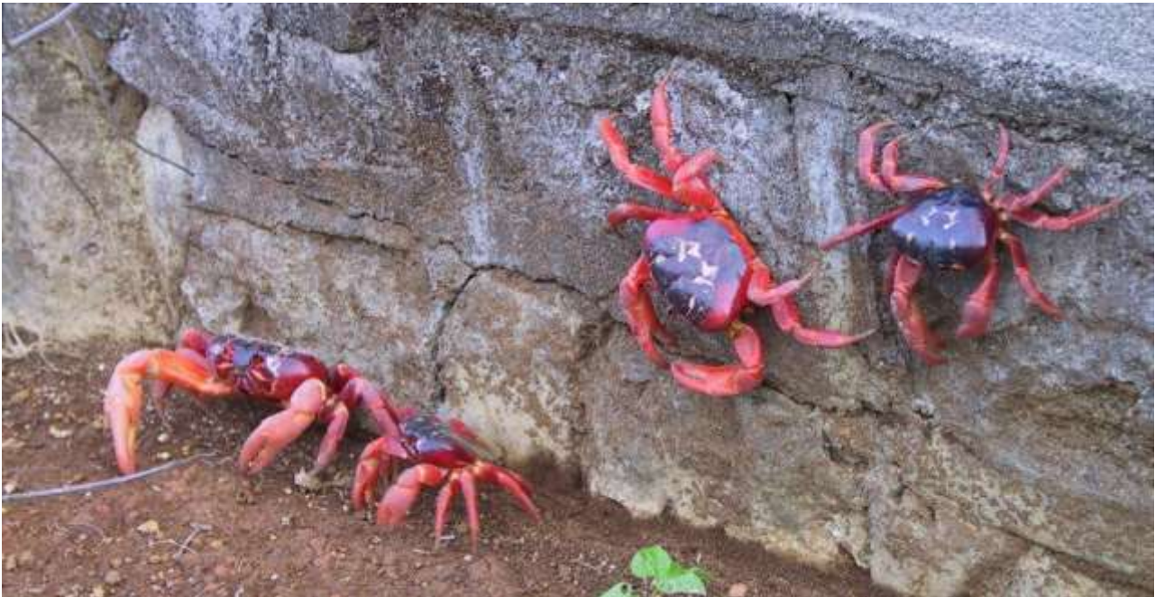
Christmas Island Red Crabs

These documents are available on the Department's website at www.regional.gov.au/territories/Christmas/land_management.aspx .