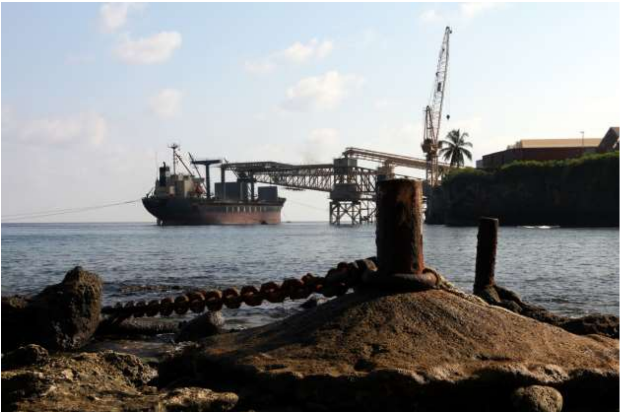
Flying Fish Cove, Christmas Island

The Department has a limited capacity to fund significant infrastructure or amenities, such as roads or services, to support the development of land parcels. Proponent/s who are successful in purchasing or leasing Crown land would be expected to install all necessary infrastructure or amenities, where they are not currently in place.