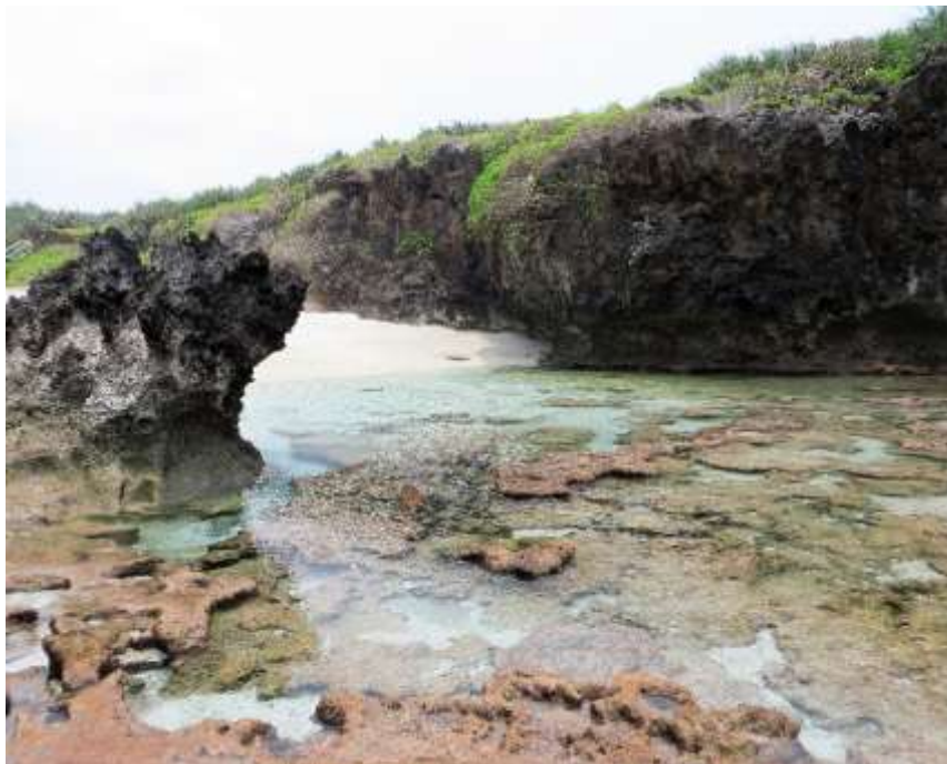
Lily Beach, Christmas Island

The prescribed format is the Registration of Interest Form, which requests all of the information listed above. The Registration of Interest Form is available on the Department's website at www.regional.gov.au/territories/Christmas/land_management.aspx .