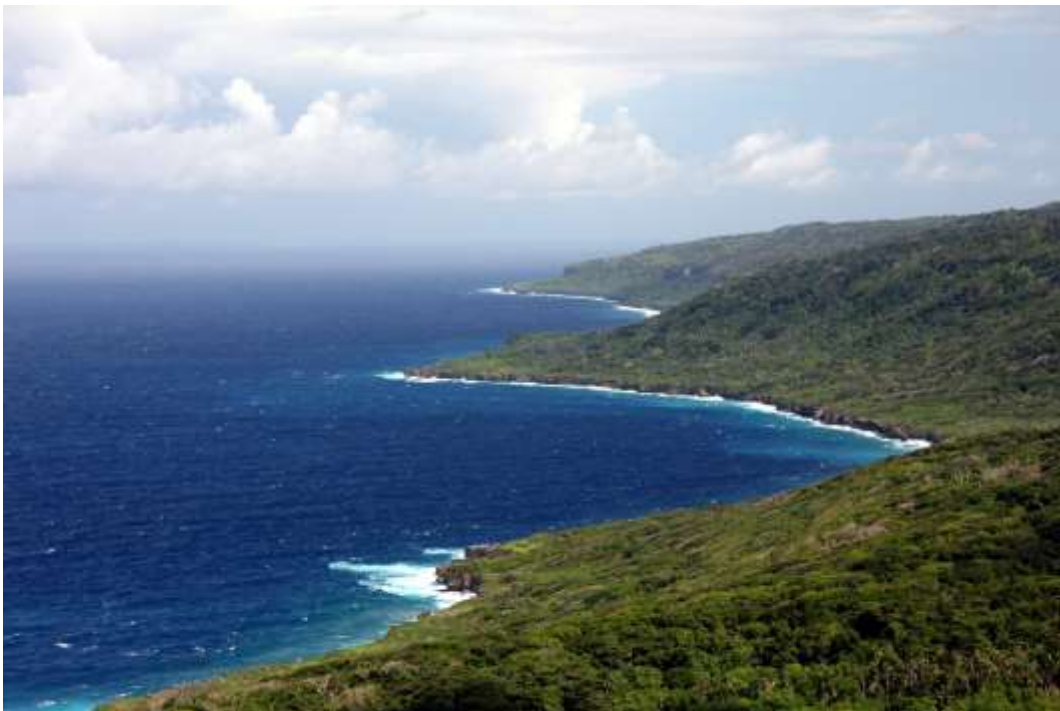
Sout Point coastline, Christmas Island

Please refer enquiries by email to: indianoceanterritories@infrastructure.gov.au , or by phone to 02 6274 6614.