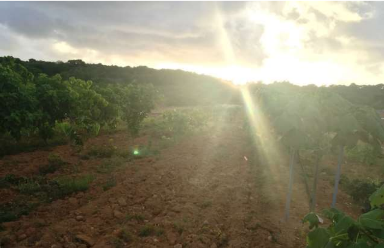
Sunset over the MINTOPE site, Christmas Island