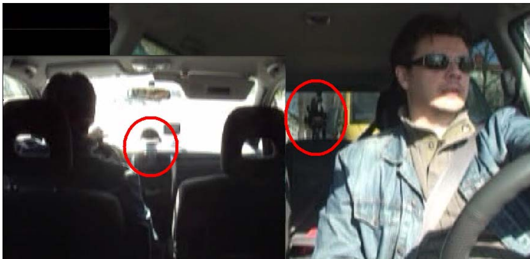
Figure 2: Two images showing the camera positions (front and rear) in the recording situation (left hand drive setup in Finland)

For authenticity, recordings were made in participants' own vehicles, and so recorded data was collected from a range of vehicle types (including sedan, wagon, hatch) and vehicle brands (including Mazda, Volvo, Mitsubishi, Lexus, and two models of Toyota). The recordings were therefore affected by variation in design and layout for different vehicles.