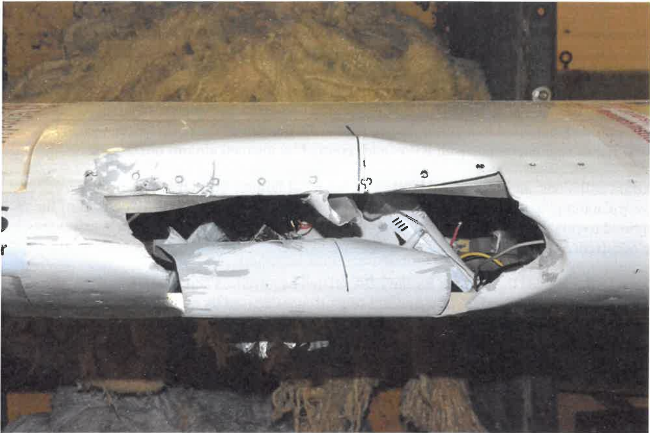
Image 1. Damage to the leading edge of a Mooney aircraft by a simulated 1 kg RPA impact.

The safety risk to persons on the ground is related to the size of the RPA or model aircraft. An RPA and model aircraft weighing less than 2 kg is unlikely to cause serious injury or death by directly contacting a person on the ground. However, this is not to say that the risk of injury or death is zero and it is possible to devise scenarios in which injury or death could result from the operation of these small RPA and model aircraft. For example, an RPA or model aircraft could seriously damage a person's eyesight.