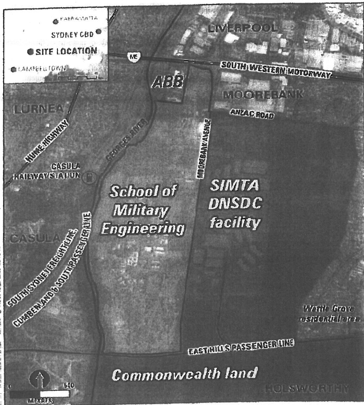
Moorebank Intermodal Terminal vicinity map