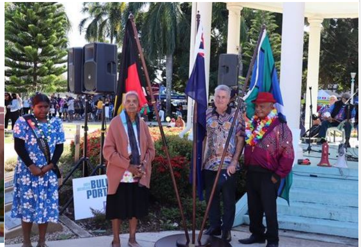
NAIDOC celebrations in Mackay last week.