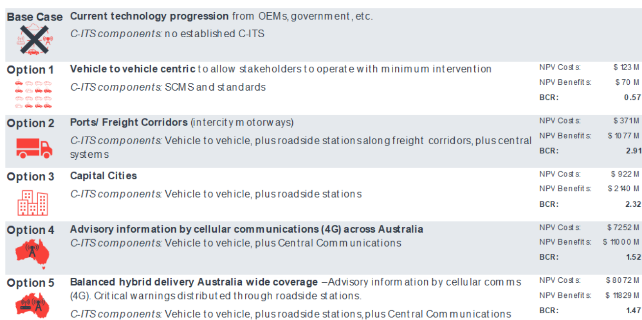
Figure 2: Cost-benefit analysis options and results

the second, geographically limited scenario optimises the BCR results. All further BCRs are also above 1 (see Figure 2, below). Further, the quantum of economic return climbs as the level of government investment rises through the scenarios, with the quantum of benefits rising from just over $1B in scenario 2 to $11.8B in scenario 5 over 10 years. The economic return followed a similar climb, with option 5 having the greatest economic return at an estimated $3.757 billion over the modelled ten-year period.