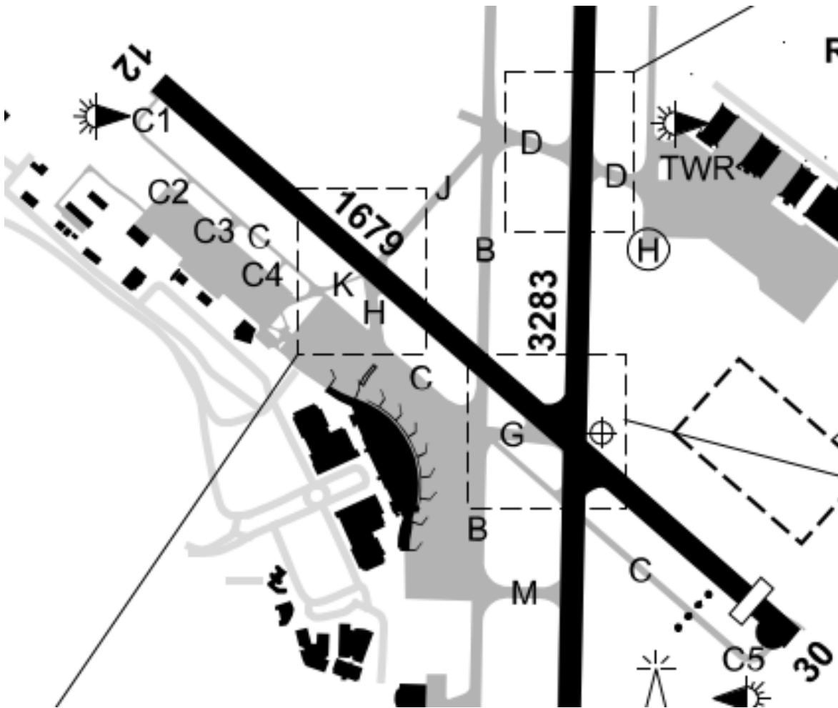
Figure 2-1: Taxiway locations