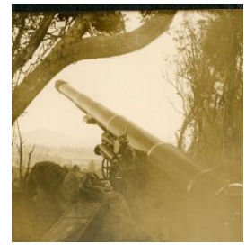
ANZAC Day 2026 pictures courtesy of 230 ACU – Norfolk Island