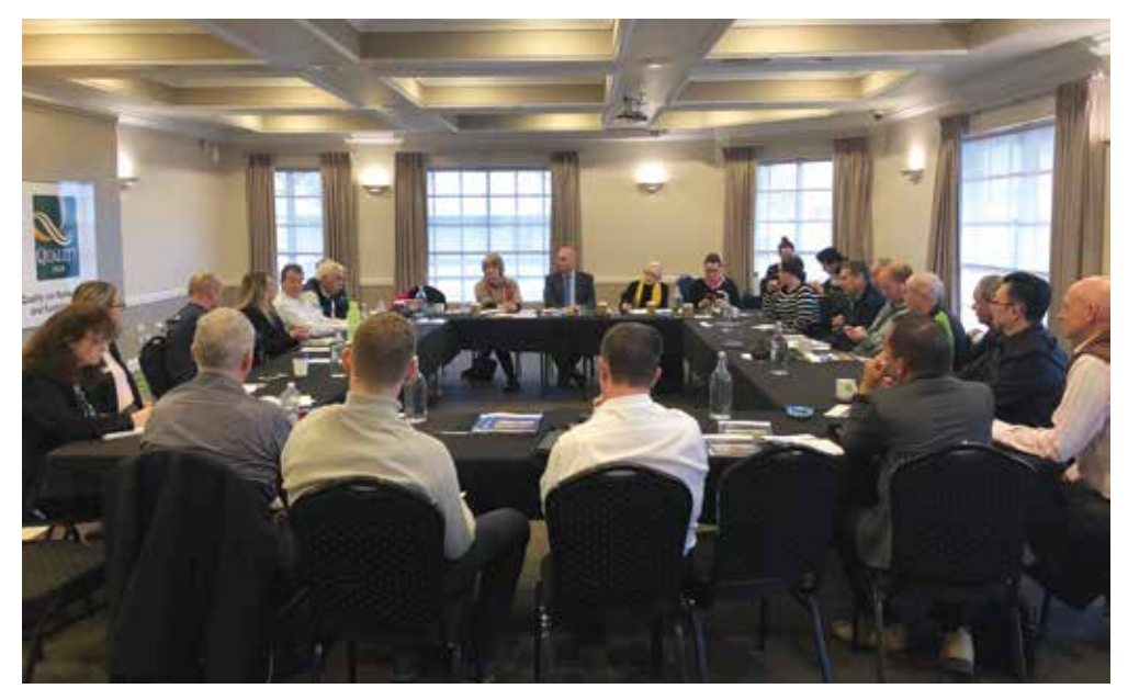
Public consultation in Kalgoorlie, WA