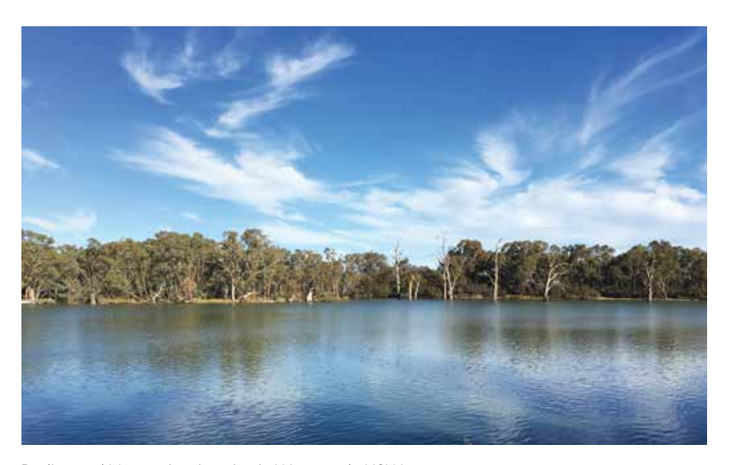
Darling and Murray river junction in Wentworth, NSW

The NBN is a vital first step to addressing these challenges. To ensure all Australians benefit from this innovation we must first ensure we have the right enablers in place: adequate bandwidth and coverage for regional and rural communities, affordable equipment, digital ability and literacy.