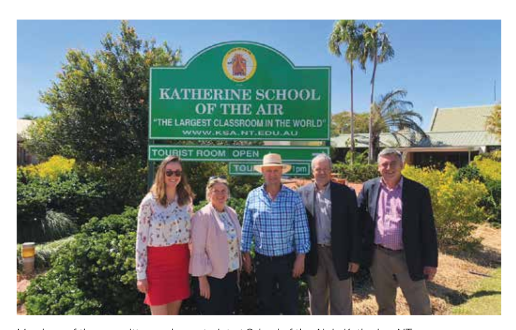
Members of the committee and secretariat at School of the Air in Katherine, NT

The committee's visit to the School of the Air in Katherine, Northern Territory revealed first-hand the impact the internet has had on students studying in remote areas. The committee observed lessons being delivered online, where students could interact with each other and teachers by live messaging or over the phone.