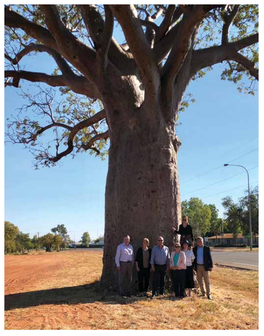
Members of the committee and secretariat with boab tree in Kununurra, WA