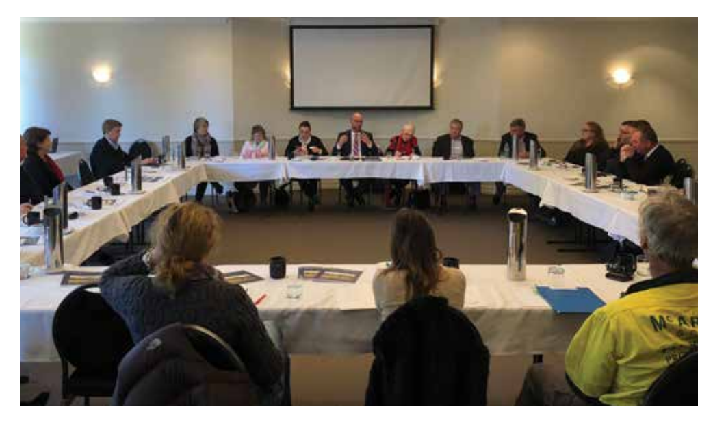
Public consultation in Tamworth, NSW