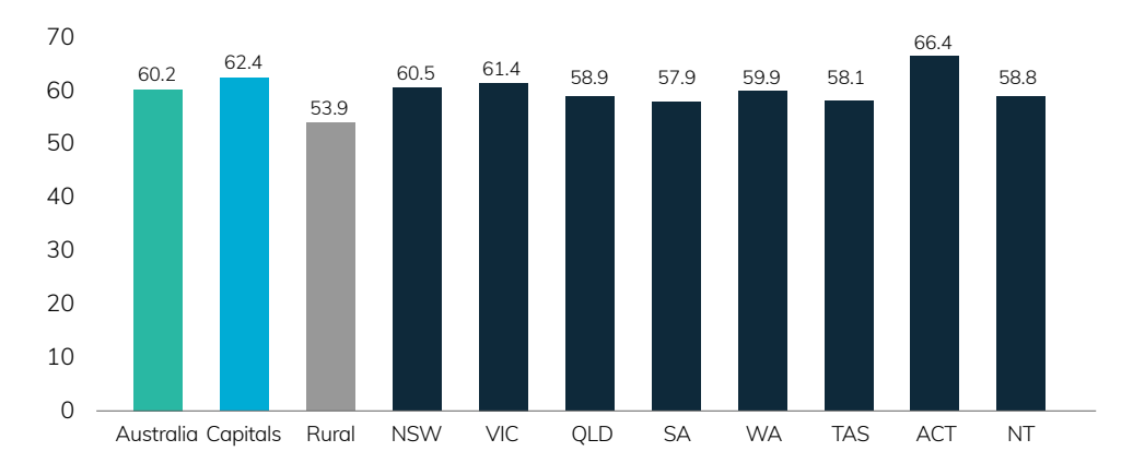
Figure 1 Australian Digital Inclusion Index 2018 Data by Geography