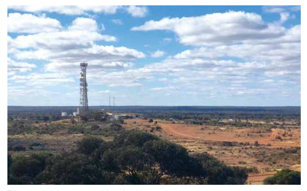
Telecommunications tower at Kalgoorlie, WA