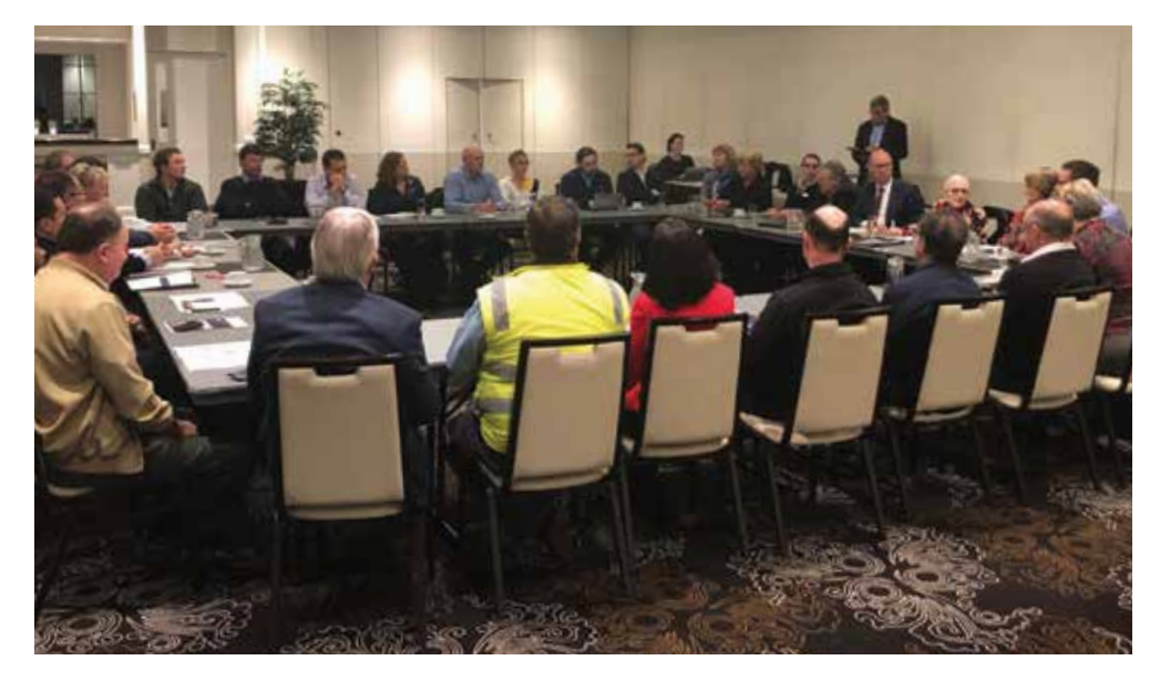
Public consultation in Griffith, NSW