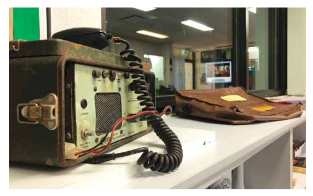
Old technology originally used for delivering lessons at School of the Air, Katherine, NT

While the internet has been a game changer for School of the Air, the landline is still important. For distance education students in the satellite footprint, the landline service is essential in ensuring daily access to students and teachers, even when the internet fails.