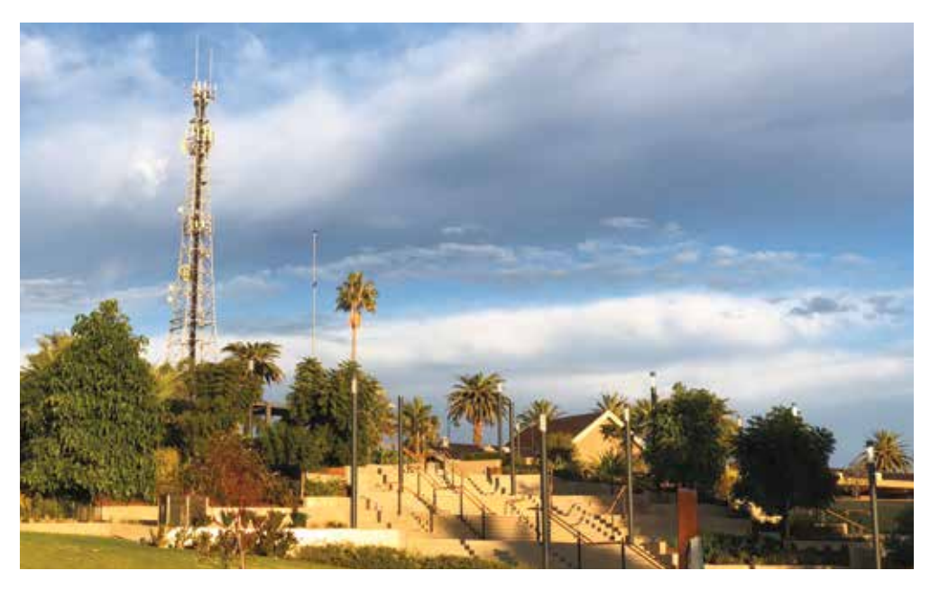
Telecommunications tower in Mildura, VIC