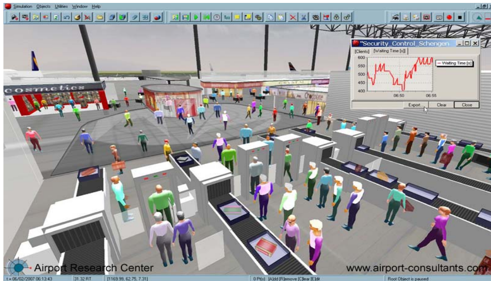
Figure 5 Example of a CAST model simulation http://www.airport-consultants.com/index.php?option=com_content&task=view&id=26&Itemid=51

The modelling tool was built using both data collected during the trial and data collected previously by international counterparts. The aim of this work was to model the oversized LAG item screening process and to consider the impact of different technology configuration options on screening point throughput. The model used for this was developed using Comprehensive Airport Simulation Technology (CAST) and was validated against an existing CAST model.