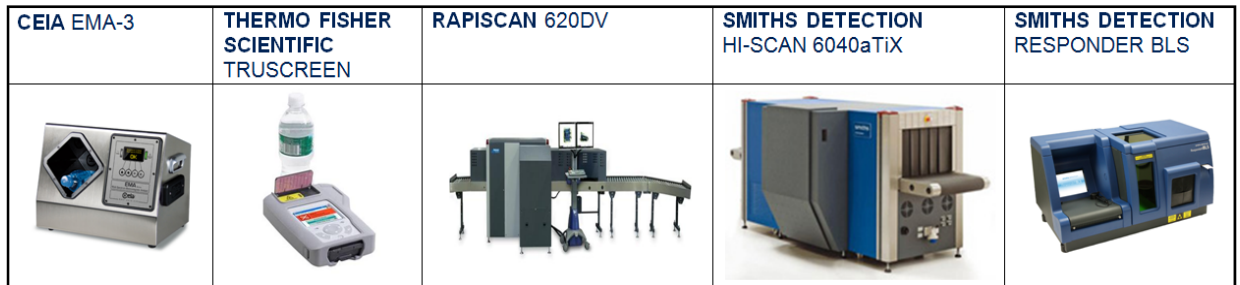
Figure 1 Equipment used in the Joint LAGs Trial 2010

Persons presenting for screening were directed by a screening officer to undergo screening at the trial lane on a random and continuous basis. Screening through the trial lane was mandatory for those selected as facilitating this trial on a voluntary basis would have notably reduced the validity of the data collected and prevented it from being a representative sample. Operations at the trial lane were performed in accordance with a separate supplementary notice prescribing the methods, techniques and equipment to be used for screening at the trial lanes.