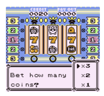
Figure 2: Pokemon Red slot machine