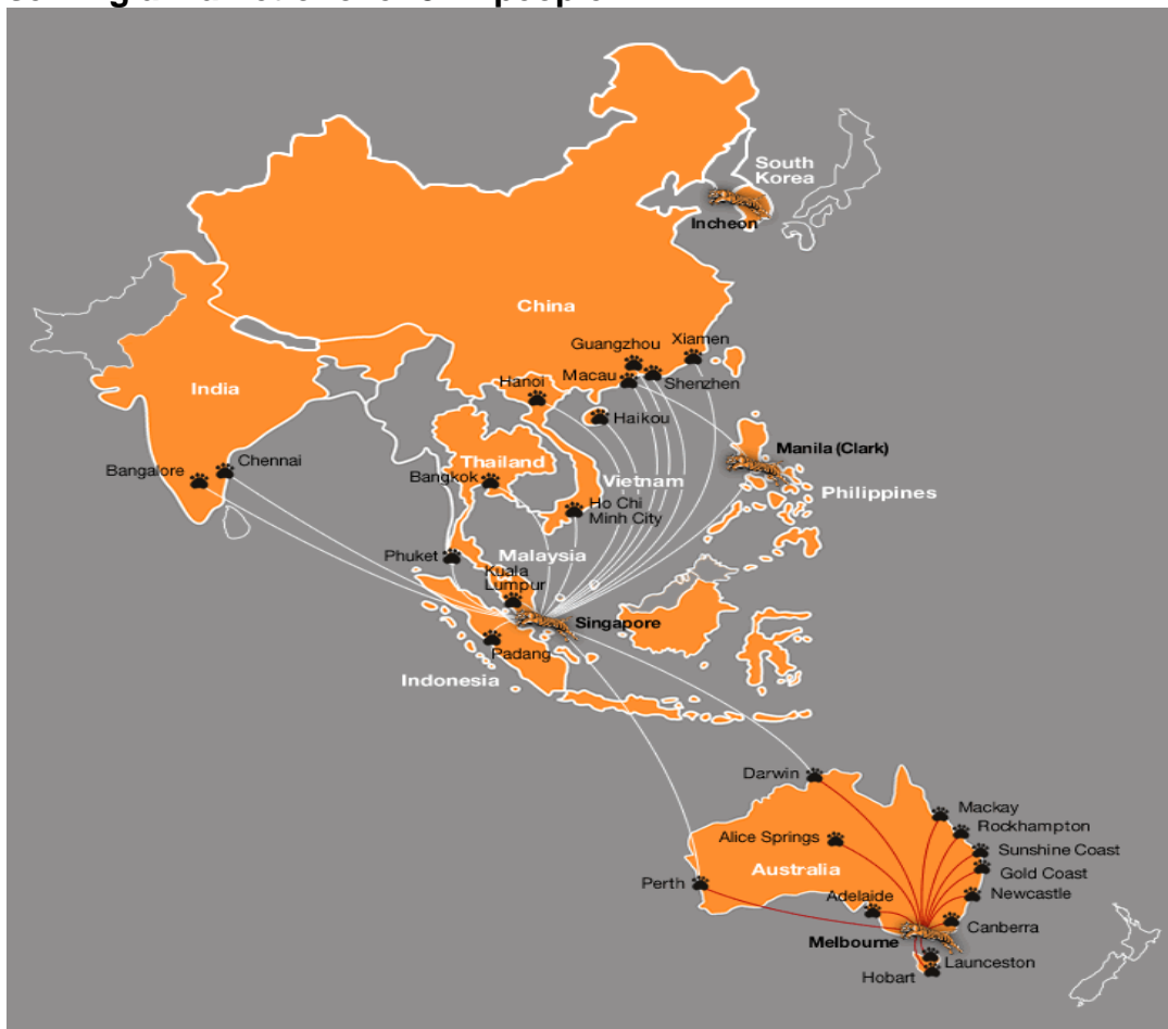
Fig: Tiger Airways network- The most extensive LCC network across Asia Pacific serving a market of over 3Bn people

Tiger Airways Australia is part of the Tiger Aviation group of companies which form the Asia Pacific region's only true low fare airline group. The airline is based on the successful business model of low fare airline Ryanair, now the world's largest international airline in terms of passengers carried. Tiger Airways offers passengers not only the lowest airfares in the market, providing invaluable opportunities for affordable travel for all Australians, but safe, reliable and convenient point-to-point air travel. Tiger Airways first took to the skies in Asia during September 2004 with two aircraft in its fleet and three routes in its network. In less than four years of operation, Tiger Airways now flies the widest geographic network of any low fare airline in the region to more than 27 destinations across 9 countries, including major growth markets such as India and China, on a fleet of brand new Airbus A320 aircraft. Tiger Airways commenced domestic flights in Australia on 23 November 2007 and currently serves a network of 13 destinations from our home in Melbourne, Victoria. Tiger Airways is currently establishing another hub operation in North East Asia through the creation of Incheon Tiger Airways, which will serve the important markets of Korea, Eastern China and Japan.